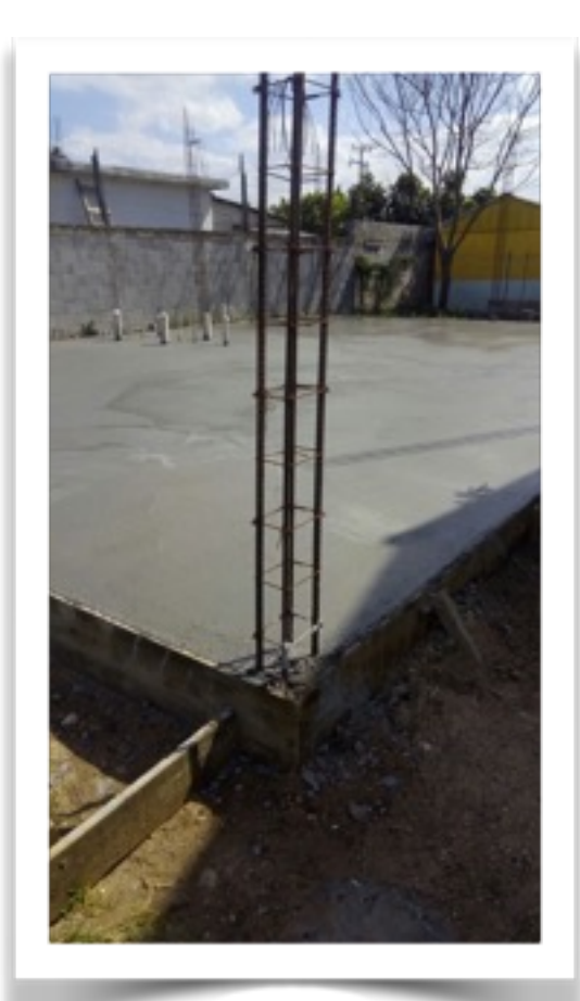
Generous donations provided the new floor