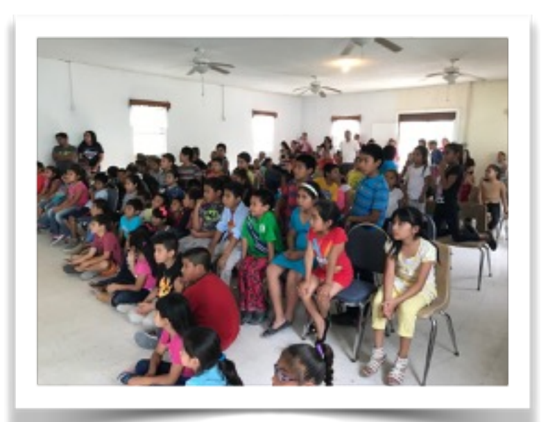
While also conducting Vacation Bible School for the Colonia children

Sendero (the path) needed a new home badly, as the original wooden home was now over 20 years old and badly deteriorated. At the end of last year, we saw the need and committed to the pastor that we would attempt to raise funds and look for churches who would be willing to take on the task of building the new house. The response was good, and we had several thousand dollars donated for the