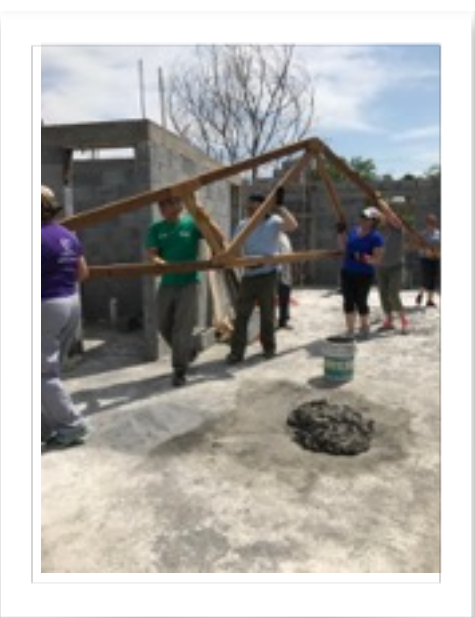
The old trusses were moved to the new house