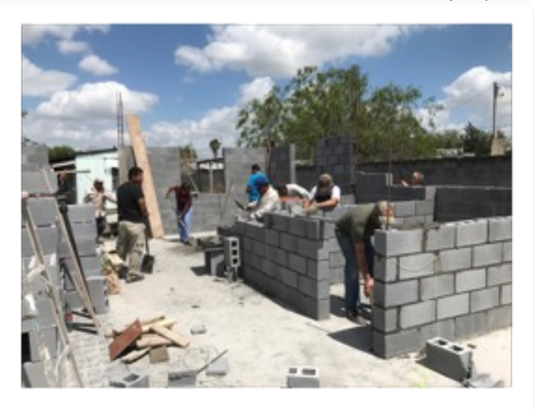
The River City New Braunfels group built the block walls