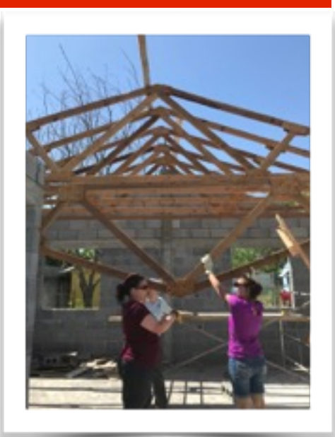
And lifted in place