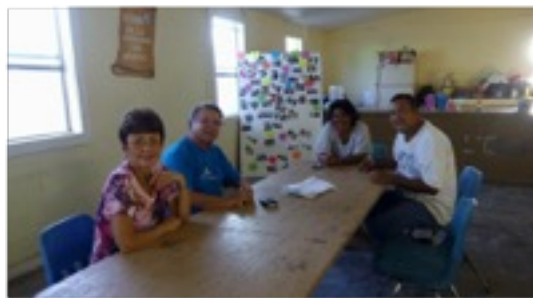
Meeting with new pastor at El Sendero

We always talk on the way home about how grateful the pastors and the friends we have met over the years are. We usually travel all over Reynosa visiting, and have never had a problem. We continue to pray for help from the America churches to come again. The Mexicans are our neighbors, and are in need. Please pray we will see people come back. We are over 70 years old and wonder if we will ever see churches in the states put aside their unwarranted fears and come to help their neighboring Christian brothers and sisters.