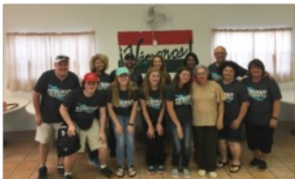
The "Project Fortify" group