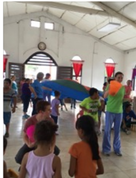
Playing wit the kids before VBS is always a highlight

As we talked about our day each night in our sharing time, we realize how blessed we are. Most of us said we have so much that it takes all our time to care for all our stuff. As you read this, think about