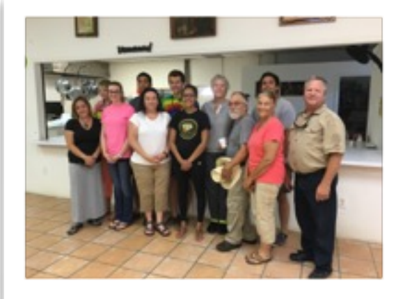
The team from New Braunfels. 5 of the 12 were our own family. What a blessing!

We hope all of you are enjoying your summer.