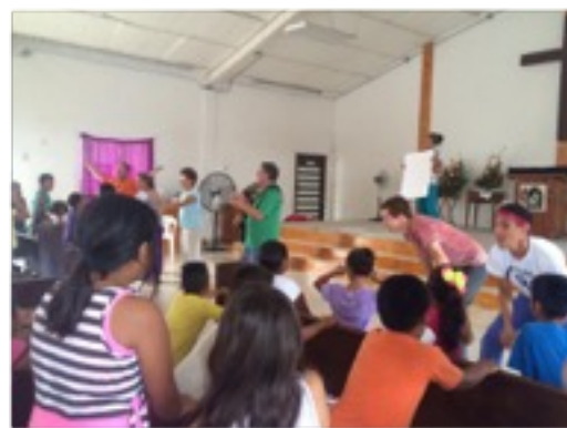
One day, the worship team was our entire family!