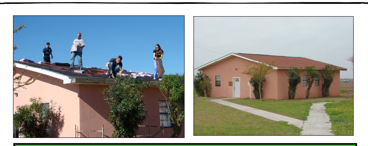
A now roof is installed on our first dormitory by the group from Anna, Illinois